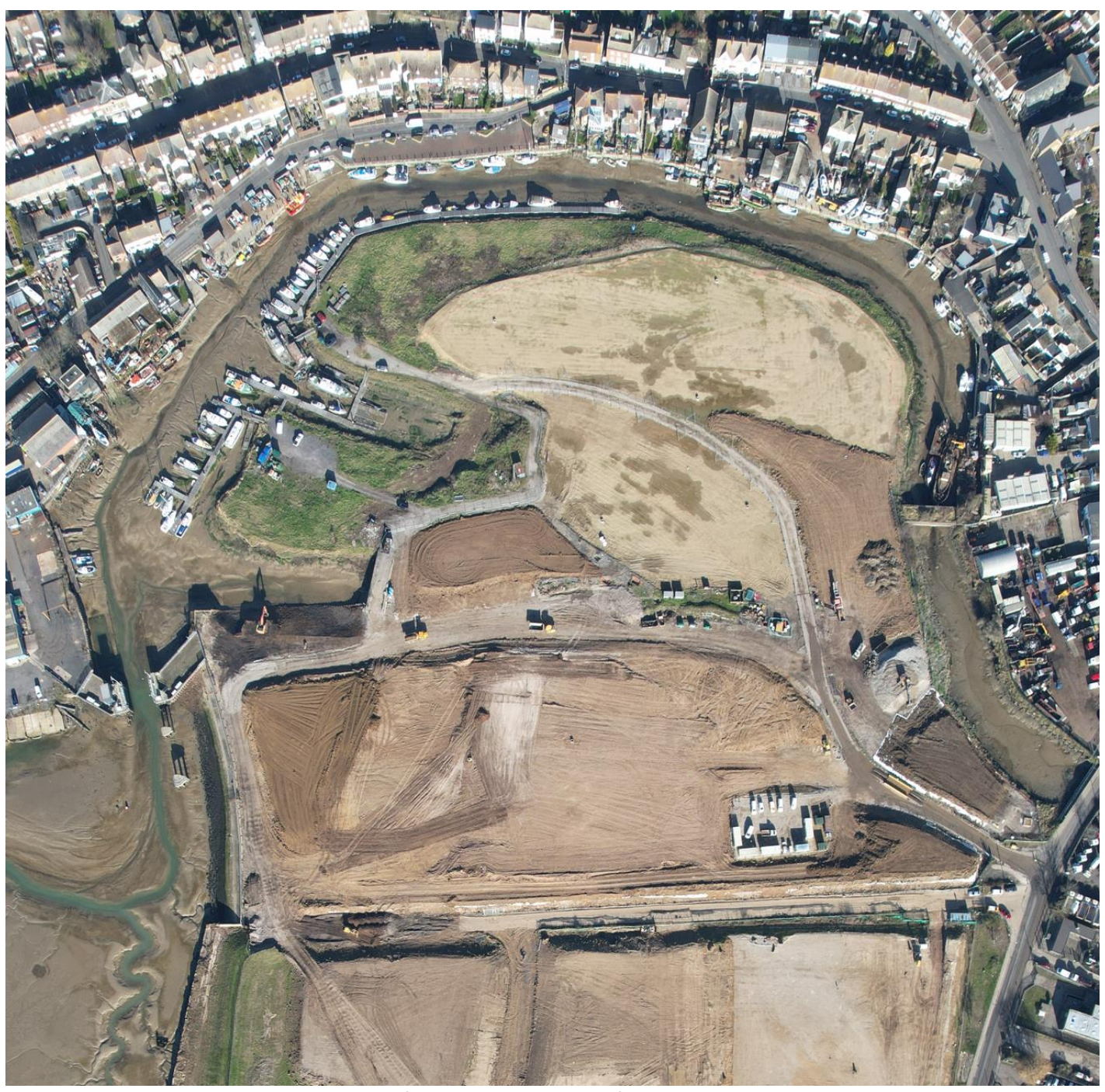
Klondyke site- works almost complete (Twyfords site to the south of the road)